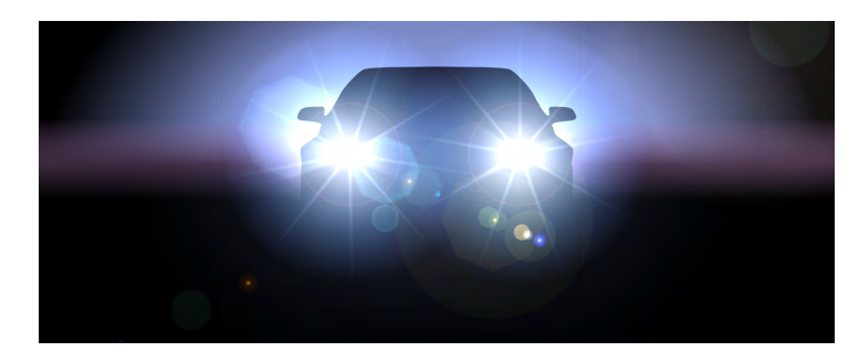
76% of pedestrian <u>fatalities</u> occur when it's dark. 50% occur between 6:00 p.m. and midnight.<sup>2</sup>