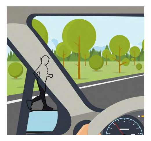
A-Pillar Blind Spot