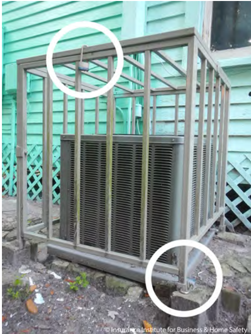
A steel cage around ground-mounted air conditioning units can prevent theft as long as it's bolted to the ground and locks are used, which are circled above.

“By recognizing the need to pay attention to the property and address small problems as they arise, business and property owners are more likely to avoid costly repairs, serious damage, and a reduction in property value.”