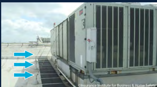
Note the reinforced cables helping secure the HVAC system on the commercial roof pictured above.