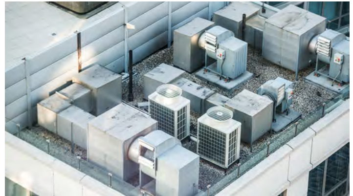
Don't leave roof-mounted HVAC systems exposed to severe weather without proper protection.

For more information on attachment of roof-mounted mechanical equipment, please refer to FEMA's " USVI-RA2 Attachment of Rooftop Equipment in High-Wind Regions ."