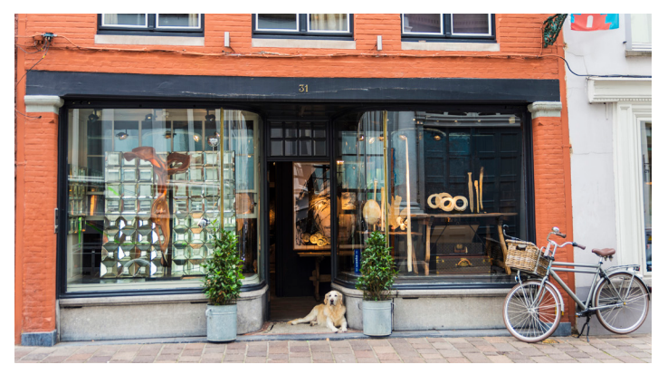
It's important to protect windows during high winds in order to reduce costly damage and interruptions.