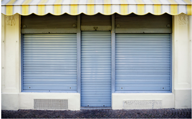
Plywood (top) should only be used as a last-minute alternative, while roll-down shutters (bottom) are the easiest to activate.

To determine the best option for your facility, consider the following questions regarding advanced deployment: