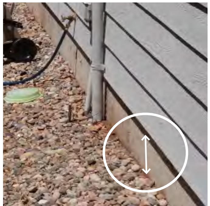
Example of good ground-to-siding clearance.